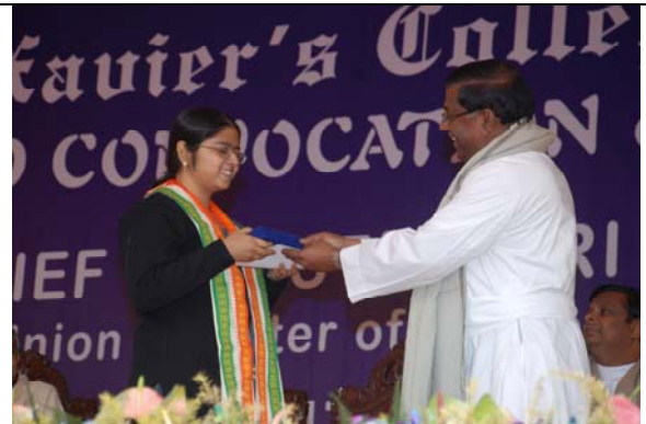
Convocation and Valedictory – 17 th January, 2010.