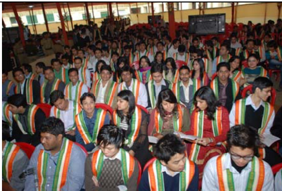
Convocation and Valedictory – 17 th January, 2010.