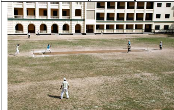
Cricket Match between College and School Alumni