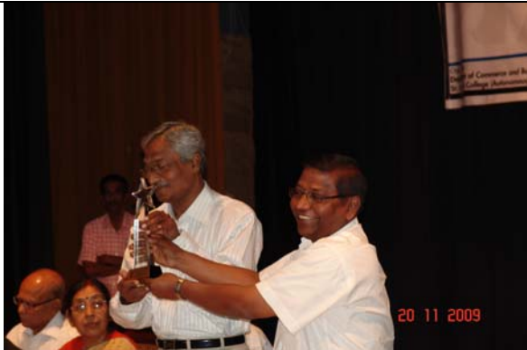
Fr Principal presenting memento to Shri Nirupam Sen, Hon'ble Minister of Commerce & Industry, Govt. of West Bengal.