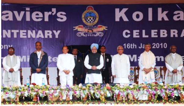
Hon'ble Prime Minister of India - Dr. Manmohan Singh, Hon'ble Governor of WB - Shri Devanand Konwar, Hon'ble Chief Minister of WB - Shri Buddhadeb Bhattacharya and Jesuit Fathers on the occasion of Sesquicentenary Celebrations – 16 th January, 2010.