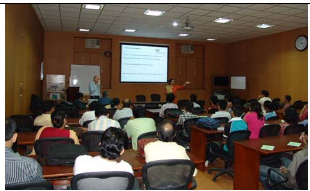
Presentation by Sussex University