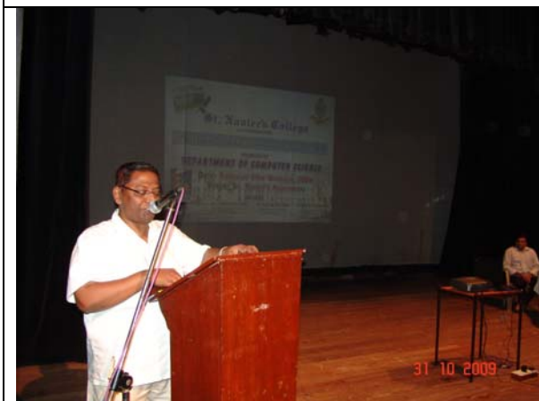
Seminar organized by Computer Science Department