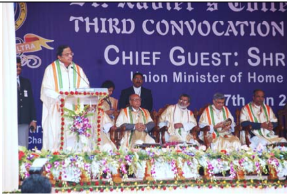
Hon'ble Home Minister Shri P. Chidambaram delivering the convocation address on the occasion of the Convocation and Valedictory – 17 th January, 2010.