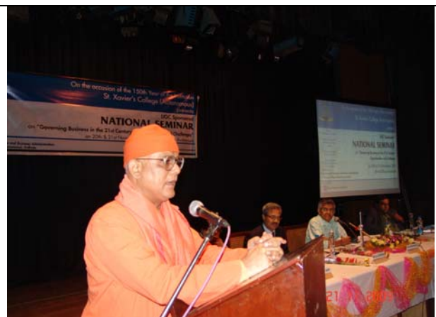
National seminar organized by Dept. of Commerce and BBA