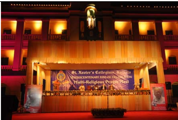
Multi-Religious prayer meet to celebrate the Sesquicentenary Celebrations – 18 th January, 2010.