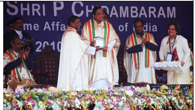
Fr. Principal presenting memento to Hon'ble Home Minister Shri P. Chidambaram on the occasion of Convocation and Valedictory – 17 th January, 2010.