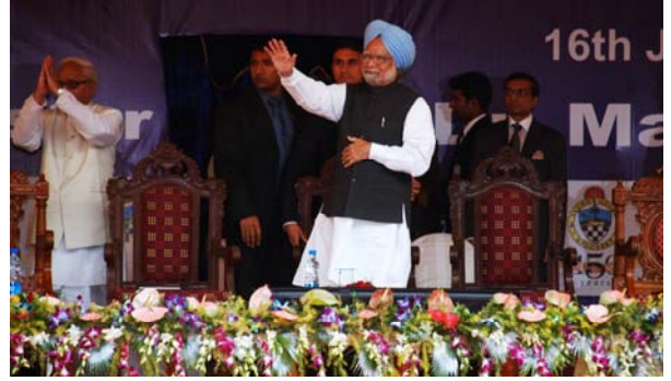
Hon'ble Prime Minister Dr. Manmohan Singh and Hon'ble Chief Minister of WB Shri Buddhadeb Bhattacharya on the occasion of Sesquicentenary Celebrations – 16 th January, 2010.