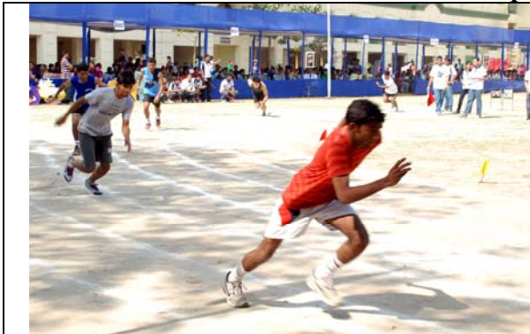
Annual Sports - 2010