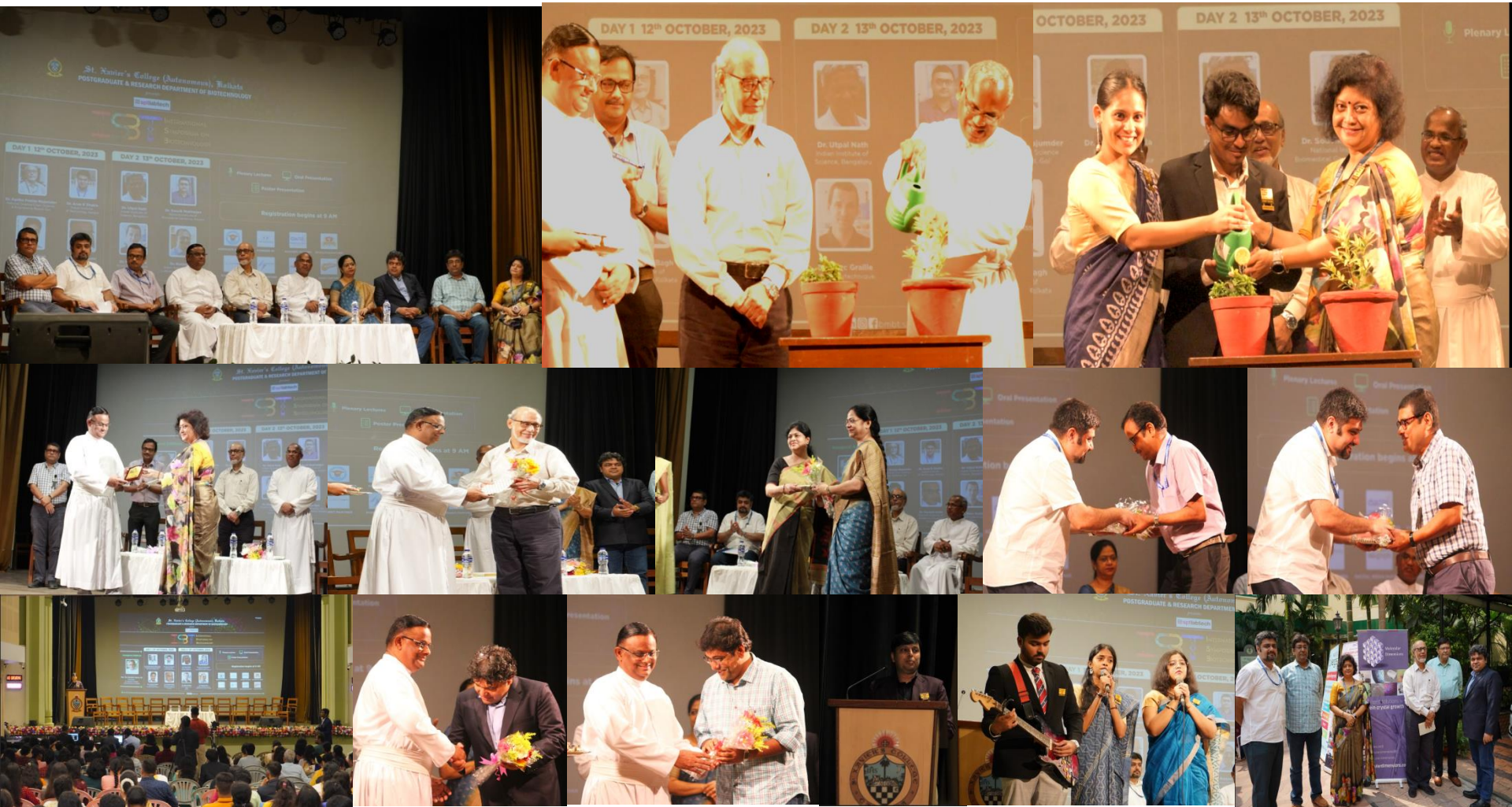
FELICITATION OF THE DIGNITARIES, WATERING OF THE PLANT TO INAUGURATE THE SYMPOSIUM & INAUGURAL SONG