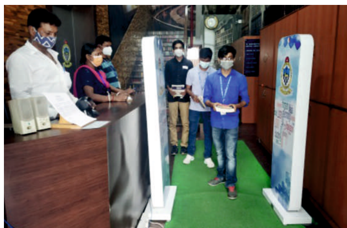
RFID Based Security