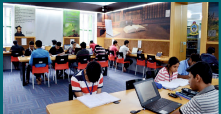
E-Resource Centre for Advanced Studies and Research