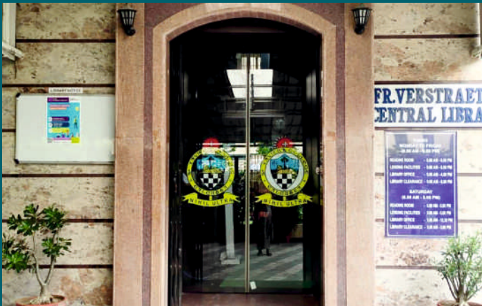
Library Front View