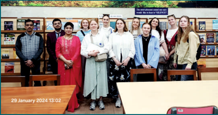
Visit by the Students of Oslomet University, Norway