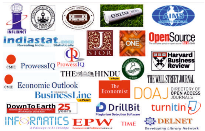
Central Library E-Resources