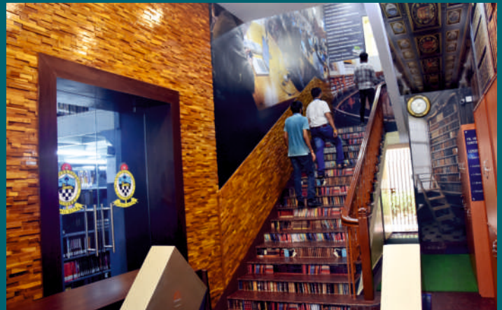
Library Entrance - Inside View