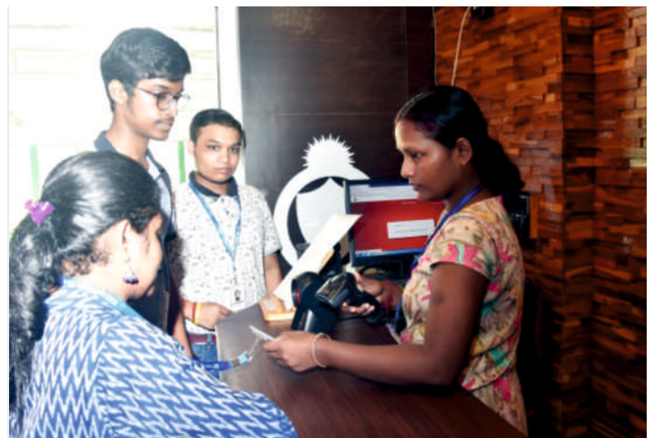
Computerised Attendance System