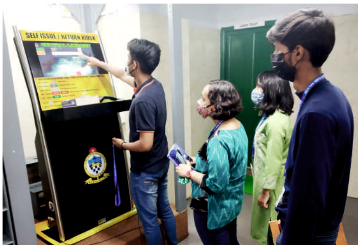
RFID Enabled Self Circulation Kiosk