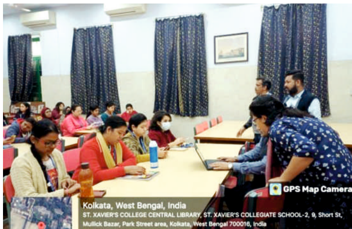
E-Resources Awareness Programme