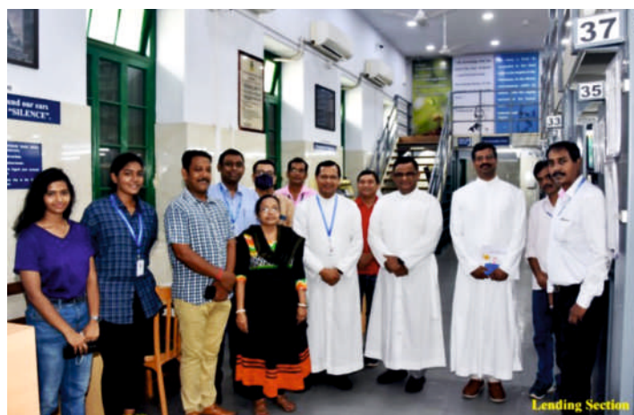
Fr. Principal & Vice Principals with Students and Staff at the Library

Anti-Plagiarism Software: i-Thenticate hosted by Turnitin & DrillBit (For Regional Languages)