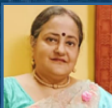
Smt. Sirin Ray Postgraduate Department of Education St. Xavier's College (Autonomous) Kolkata