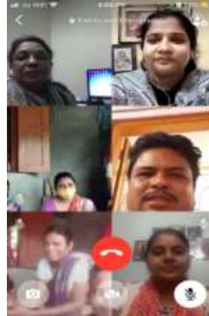
Virtual Follow- up training session with trainees