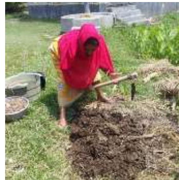
Trainees rotating the compost pit as guided by expert