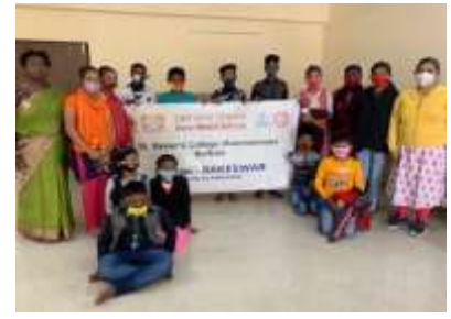
Need assessment with Bakeswar children