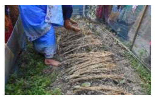
Organic nutrition garden bed created