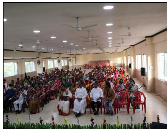
The Chief Guest joins to see the cultural performance