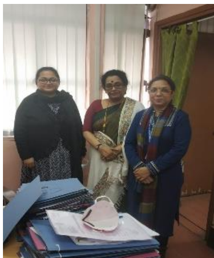
UBA coordinator with the Chairperson (middle)