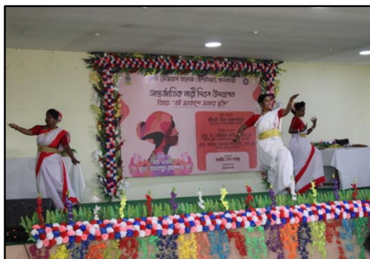
Cultural performance by the participants from the villages