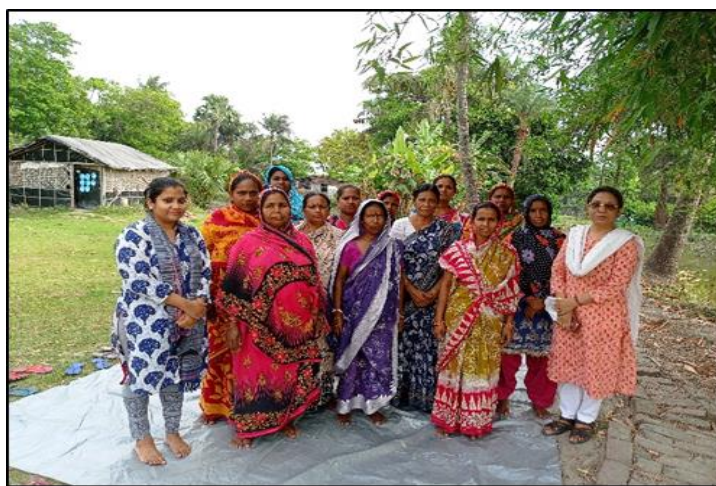
The trainees who were motivated to begin compost making along with UBA coordinator (extreme right)

A meeting was conducted at Shalpokur village on 31st March 2022, with the women who had attended the in-depth training on compost making and organic kitchen garden in March 2021. The 15 women present, were encouraged to practice whatever they had learnt in their training. They shared that the compost which they had prepared last year, and were happy with the produce. However, they could not continue with the winter crops due to the following reasons: (a) Back-to-back rains, cyclones resulting in flooding (b) lack of commitment from other team members (c) Lack of availability of raw materials to prepare the compost. Nevertheless, the women have agreed to begin making the compost within a week.