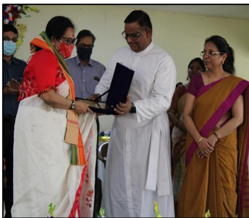
Fr. Principal felicitating the Chief Guest

To ensure the successful organisation of the Women’s Day programme several coordination meetings were conducted with for over a month beginning with permission from Fr. Principal and ensuring his presence, invitation to the Chief Guest, volunteer mobilization, women mobilization, cultural programme, Food arrangements and other logistics related to the venue.