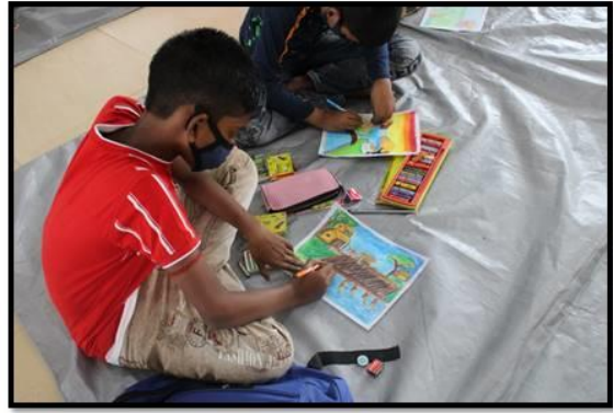
Let's save our environment