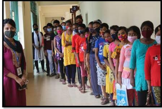
Children awaiting their turn