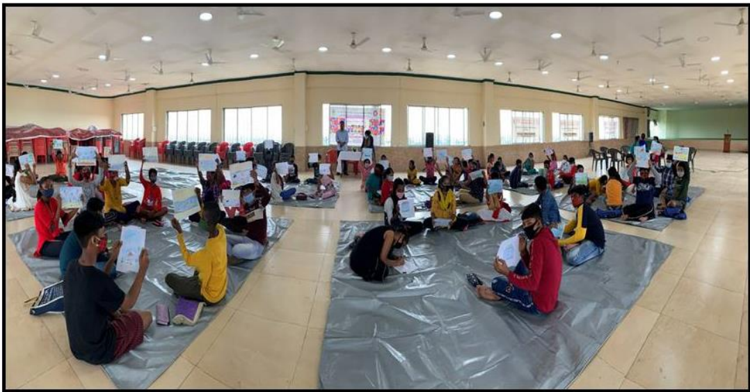
The Panoramic view