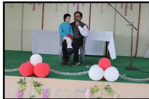
Magic Show & Talking Doll show mesmerized the audience