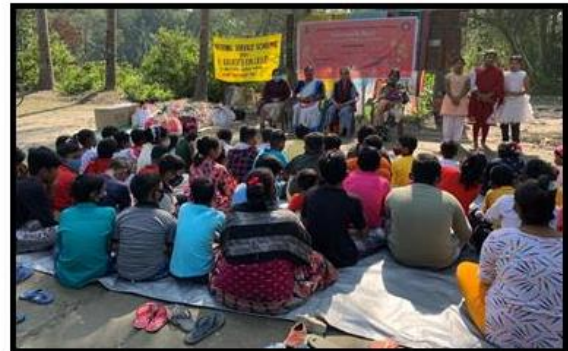
Prayer song by children