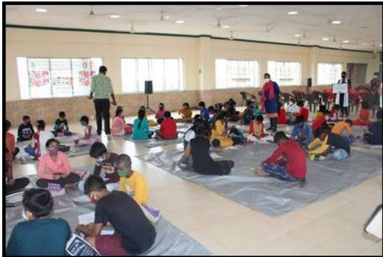
Volunteers getting the children prepared