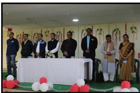
Beginning the day with a word of prayer

This initiative helped the department to build rapport with the children and SHG members, which would facilitate smooth implementation of rural development activities in the future. Within the next three months the College would conduct meetings with the BDO and other important stakeholders to carry forward all initiatives under UBA. Since there had been a gap due to the pandemic in the past two years, in 2022 we hope to resume our educational initiative with the children of the villages so that the learning gap can be dealt with at the earliest.