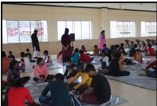
Drawing session in progress