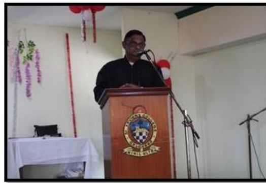
Christmas message by Fr. Principal