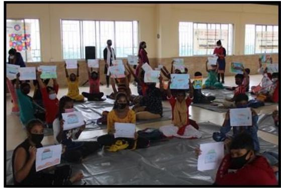
Showcasing their talents