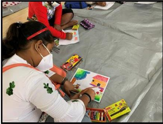
This is my take