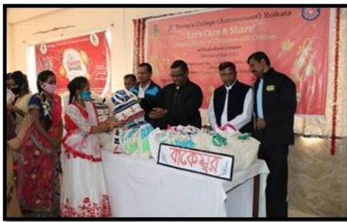
Distribution of gift bags in progress