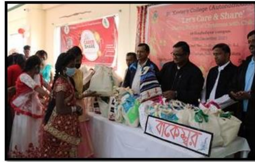
Let's Care and share