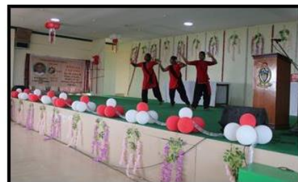
Cultural Programme by the children