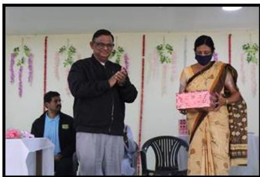
Felicitation of village contact persons of our adopted villages by Fr. Principal