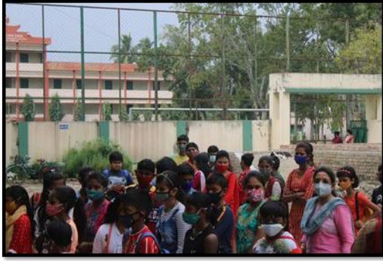
Looking forward to an exciting day