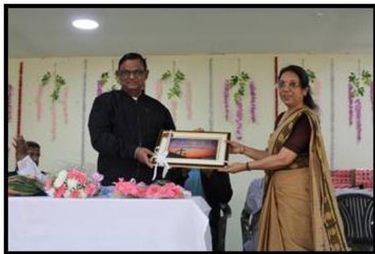
Felicitating Father Principal on behalf of NSS department