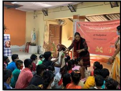
Let's Care & Share