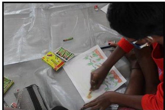
This is my take