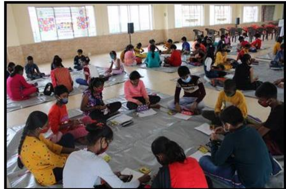
Get Set Go