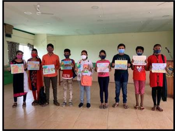
The Prize Winners