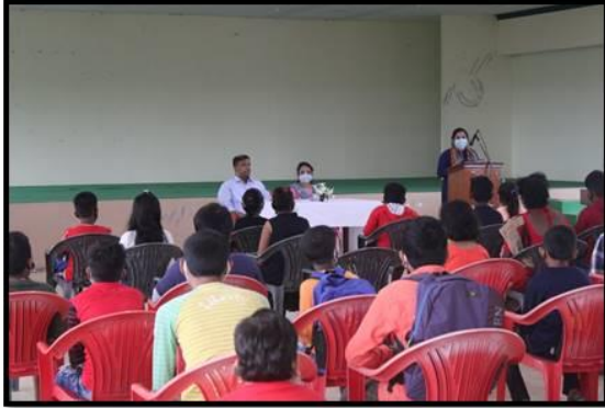
The inauguration in progress