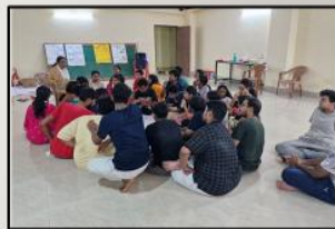
NSS VOLUNTEERS SHARING KEY LESSONS LEARNT FROM THE CAMP AND THE IMPACT OF THE RURAL YOUTH ON THEM