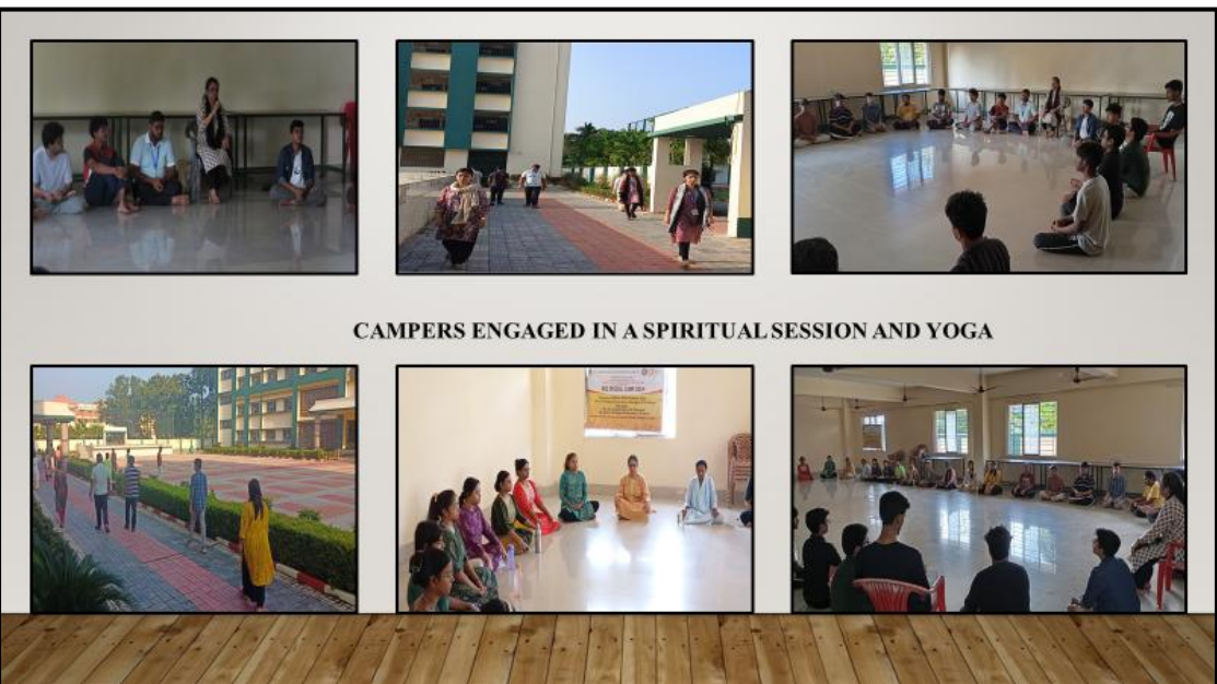
CAMPERS ENGAGED IN A SPIRITUAL SESSION AND YOGA