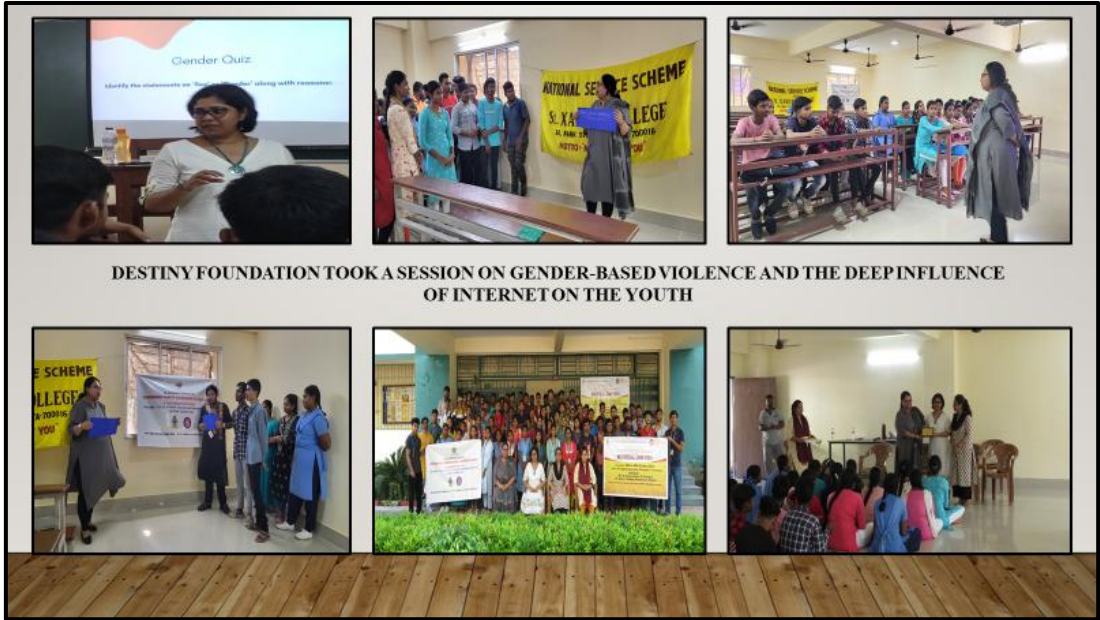
DESTINY FOUNDATION TOOK A SESSION ON GENDER-BASED VIOLENCE AND THE DEEP INFLUENCE OF INTERNET ON THE YOUTH