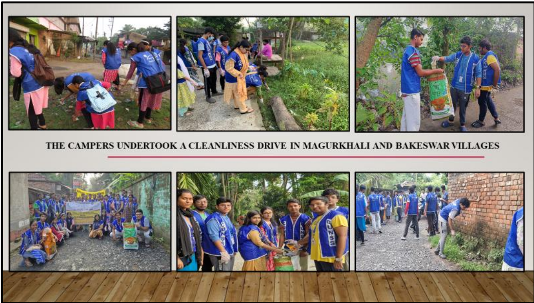
THE CAMPERS UNDERTOOK A CLEANLINESS DRIVE IN MAGURKHALI AND BAKESWAR VILLAGES