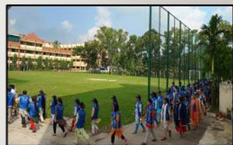
UNITY DAY WALK: PROMOTING THE MESSAGE OF UNITY, PEACE, AND HARMONY AMONG THE PEOPLE