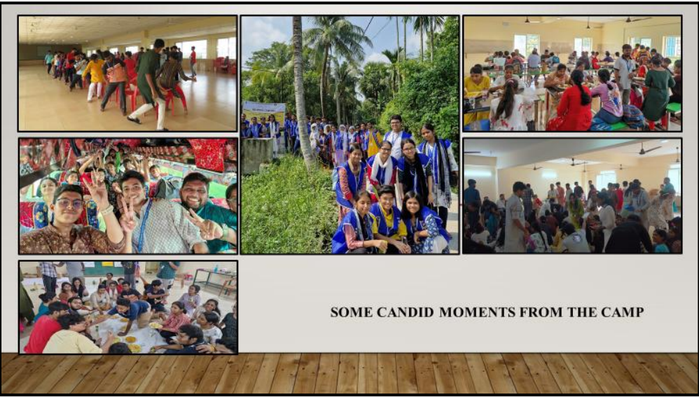
SOME CANDID MOMENTS FROM THE CAMP