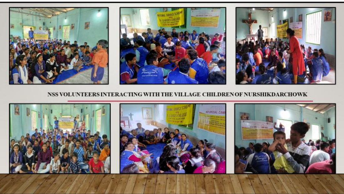
NNS VOLUNTEERS INTERACTING WITH THE VILLAGE CHILDREN OF NURSHIKDARCHOWK