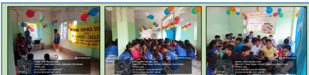
Entertainment, games, and adda at Bakeswar village on 15 th November 2024