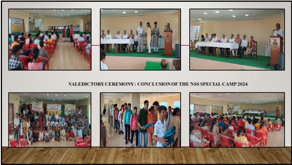
VALEDICTORY CEREMONY: CONCLUSION OF THE NSS SPECIAL CAMP 2024