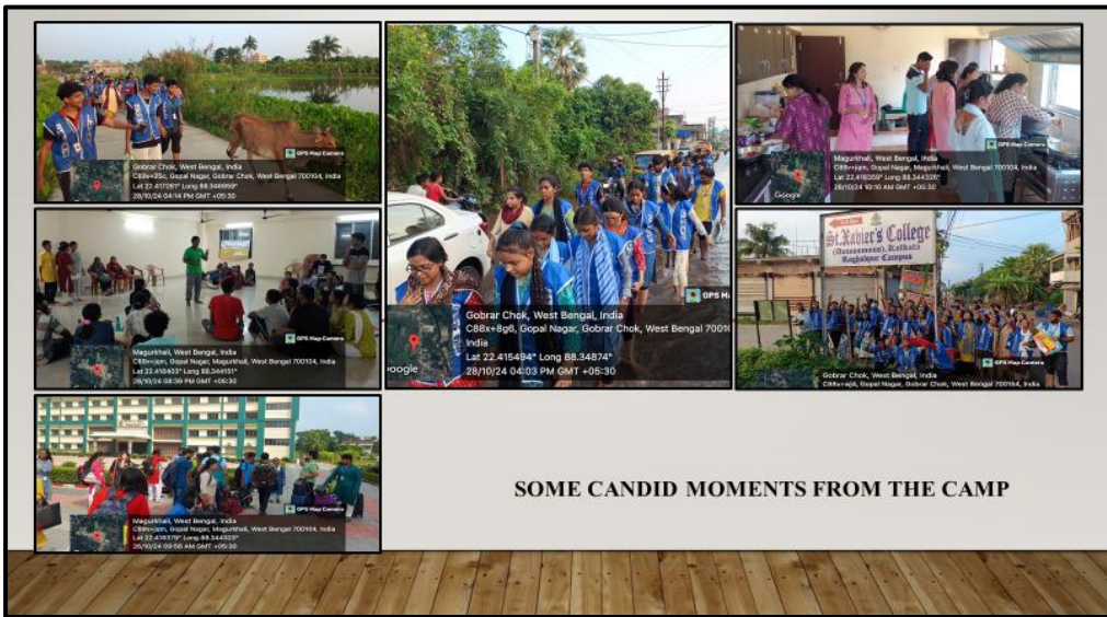
SOME CANDID MOMENTS FROM THE CAMP