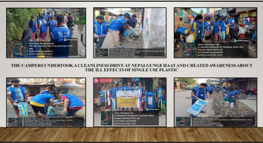
THE CAMPERS UNDERTOOK A CLEANLINESS DRIVE AT NEPALGUNGE HAAT AND CREATED AWARENESS ABOUT THE ILL EFFECTS OF SINGLE USE PLASTIC