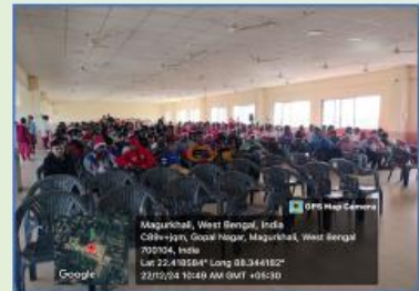
Let's Share and Care programme at the rural campus – Spreading Christmas cheer among the children