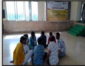
NSS VOLUNTEERS AND THE YOUTH SHARING ABOUT THEIR LEARNINGS FROM THE CAMP