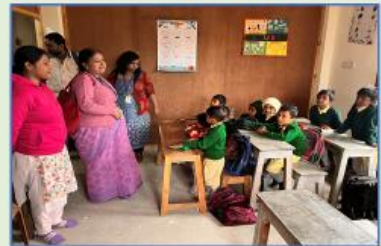
Spreading Christmas cheer at Swapno Chhoya Model School Pailan