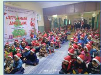
Let's Share and Care programme at Paikhala village– Spreading Christmas cheer among the children