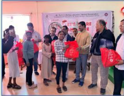
Fr. Principal, Fr. Vice Principals and other dignitaries handing over the goodie bags to the children