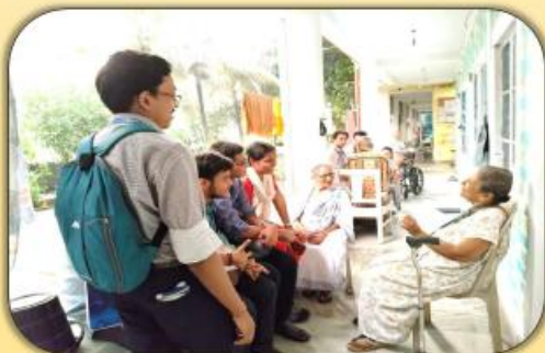
SPENDING TIME WITH THE SENIOR CITIZENS IN AN OLD AGE HOME