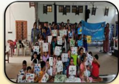
VILLAGE EDUCATION PROGRAMME IN HOGULKURIA & NURSHIKDARCHOWK VILLAGES ON 26 TH OCTOBER 2025