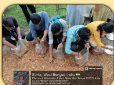
STUDENTS UNDERGOING TRAINING ON MUSHROOM CULTIVATION