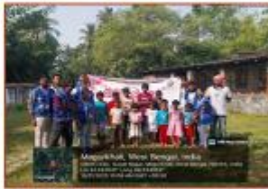
Children's Day celebrations by NSS Unit II at Debipur, Magurkhali and Raghabpur villages on 16 th November 2025