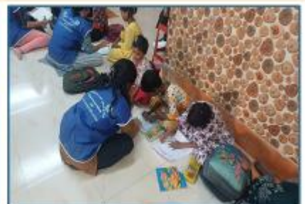
VILLAGE EDUCATION PROGRAMME was held on 2 nd & 9 th November 2025