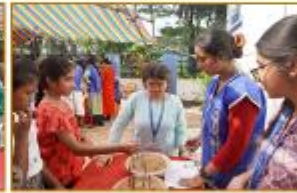
Children's Day celebrations at Hogulkuria village on 16 th November 2025