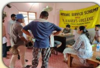
HEALTH CAMP IN COLLABORATION WITH SEVA KENDRA CALCUTTA FOR TRUCK DRIVERS AT DANKUNI PARKING LOT