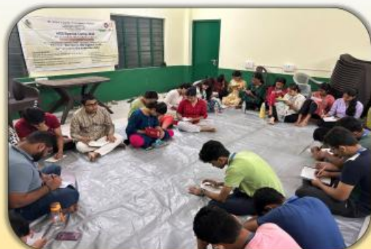
STUDENTS PARTICIPATING IN EVALUATION AND REFLECTION SESSIONS IN THE EVENINGS