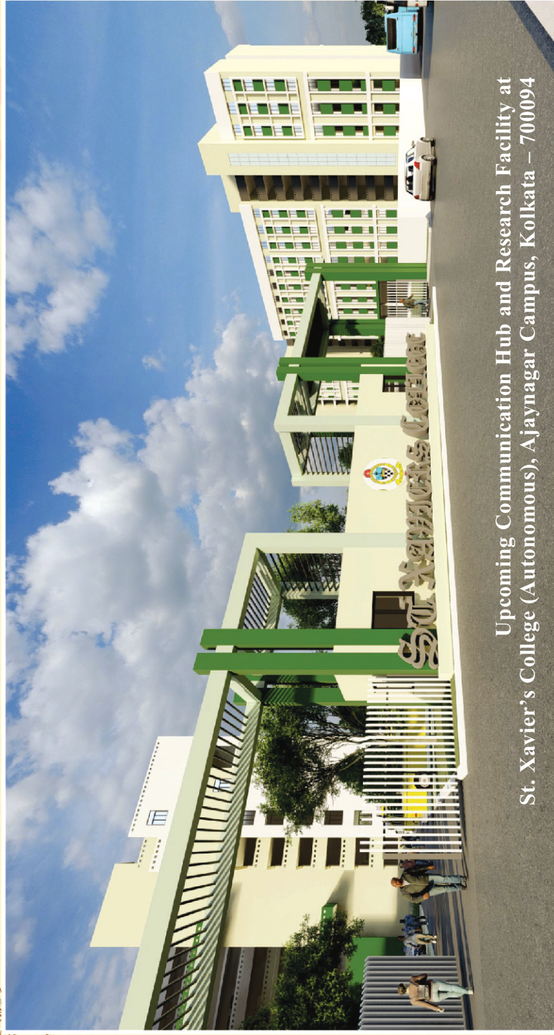
Upcoming Communication Hub and Research Facility at St. Xavier's College (Autonomous), Ajaynagar Campus, Kolkata – 700094