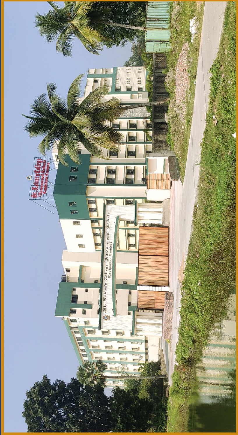
St. Xavier's College, (Autonomous), Raghobpur Campus