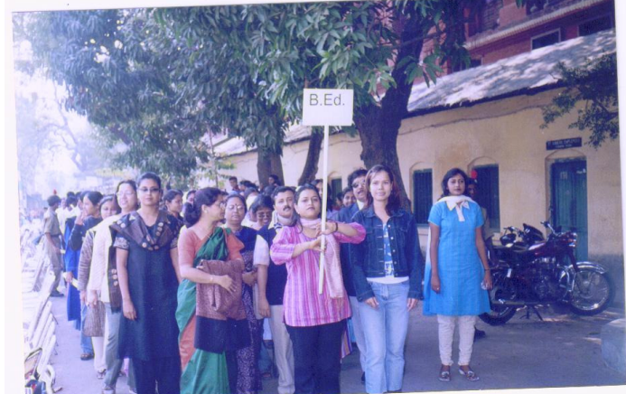
Annual Sports Day