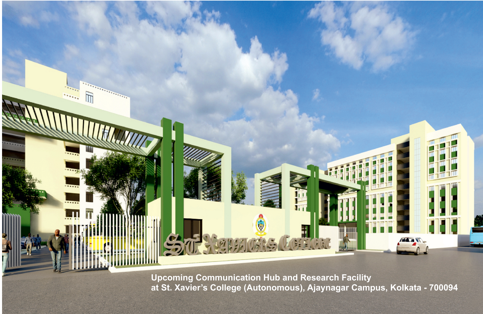
Upcoming Communication Hub and Research Facility at St. Xavier's College (Autonomous), Ajaynagar Campus, Kolkata - 700094