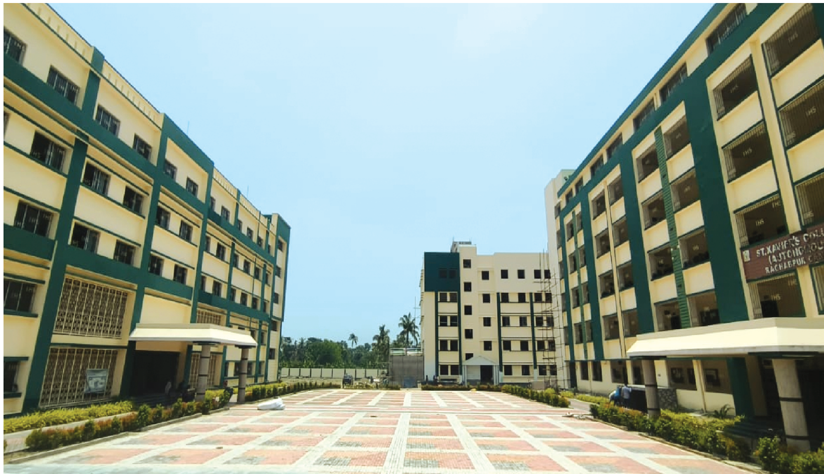
St. Xavier's College (Autonomous), Raghobpur Campus